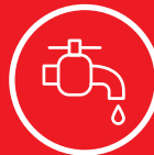
Clean vs Dirty