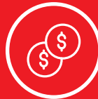
Cost of Virgin Metals